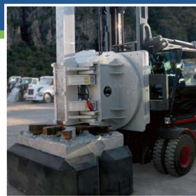
旋转式阳极棒搬运器 Rotating Anode Handler

大型面包店和杂货店的配送商可便捷地搬运面包托盘堆垛。Used in large bakeries and grocery distributors to easily handle stacks of bread trays.