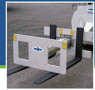
旋转器(带串杆) Rotator Boom

可从上方抓取各种货物，如橡胶，废纸和其他可回收物。 Designed to grab various products such as rubber, scrap paper and recycling goods from overhead.