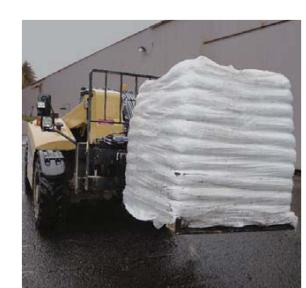
斜坡堆垛机 Slope Piler

适用于多种属具的挂装，如叉夹，纸箱夹和旋转器等。 Available with various attachments mounted such as Fork Clamps, Carton Clamps and Rotators.