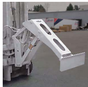
推出器 Push Loader

用于搬运宽度较大的货物，如桁架，钢筋和管道。配有额外两个货叉和固定装置以确保平稳地搬运货物。 Used for handling wide loads such as trusses, rebar and pipe. Has two additional forks and a hold down to provide stability for the load.