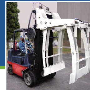
下抓式夹具 Overhead Grab

带钩状固定式压臂的铲斗，可360°旋转。 Buckets available with grapple-style hold down arms as well as 360° rotation.