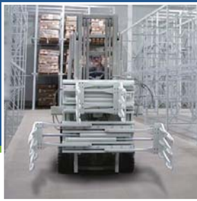
软包拨离夹 Bale Separator Clamp

专为建筑和土方行业或任何需要搬运大型轮胎的工况而设计。 Designed for the construction and earth moving industries or any application requiring the need to handle oversized tires.