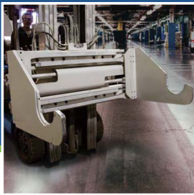
心轴搬运器 Mandrel Clamp

无论您搬运水泥管，瓷砖，铺路材料，砖块或是预应力混凝土梁，我们都能提供最佳的搬运解决方案。Whether you're handling concrete pipes, tiles, pavers, blocks, or pre-stressed concrete beams, we have the solution.