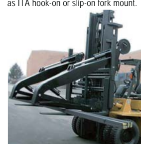
长管搬运器 Pipe Hold Down

经济性及外形简约的推出器，适用于多种需要在不同载货平台间推动货物的场合。 Economical and low profile pusher for various applications requiring loads to be pushed from one platform to another.