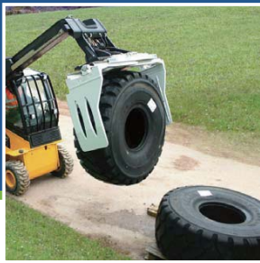
可搬运轮胎的软包夹 Bale Clamp for Tires

专为建筑和土方行业或任何需要搬运大型轮胎的工况而设计。 Designed for the construction and earth moving industries or any application requiring the need to handle oversized tires.