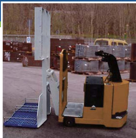
面包托盘搬运器 Bread Tray Handler

独特而经济的设计，从货物两端抓起货物，便于运输，可搭配旋转器使用。Unique and economical design grabs cylinder from ends for easy transport, also available with rotator.