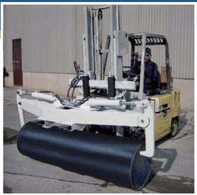
圆柱状货物搬运器 Cylinder Handler

可实现在拖车车厢或集装箱内部搬运袋装种子。Used to load trailers or containers with loads of bagged seed.