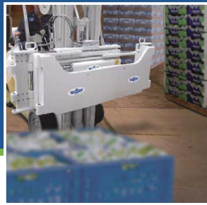
带折叠式夹臂的软包夹 Bale Clamp with Folding Arms

两台软包夹挂装在一个主旋转框架上，用于拨离冷冻包状货物。 Two Bale Clamps mounted on a main rotating frame. Used to separate bales of frozen product.