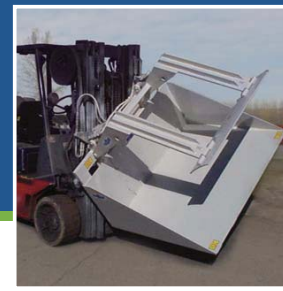
液压力铲斗 Hydraulic Bucket

独特的设计可实现夹臂向内折叠，应用于作业空间受限的场合。 Special design that allows the arms to be folded inwards. Used in areas where space is limited.