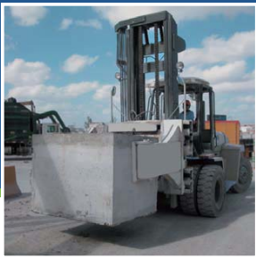
水泥搬运器 Concrete Handler

无论您搬运水泥管，瓷砖，铺路材料，砖块或是预应力混凝土梁，我们都能提供最佳的搬运解决方案。Whether you're handling concrete pipes, tiles, pavers, blocks, or pre-stressed concrete beams, we have the solution.