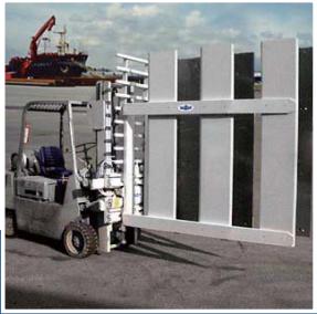
玻璃纤维搬运器 Fiberglass Handler

经特殊改造设计的叉夹，具有长货叉、可调节以及可锁紧轮胎等特点。可将车辆置于货架上。Specially designed Fork Clamp with long forks and adjustable, locking wheel supports. Used to load cars into racking