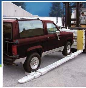
车辆搬运器 Car Handler

用于拆装货架或印刷机上的钢卷轴，以及任何需要搬运柱状货物的场合。Designed to handle steel rolls into and out of racking or printing presses, also used for any application requiring a round object to be cradled.