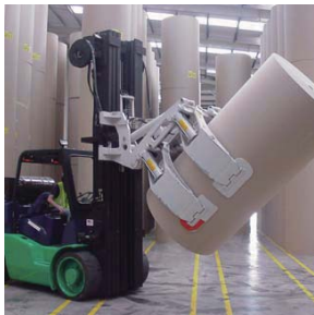
前倾式夹类 Upending Tipping Clamp

带串杆式旋转器装有液压力推出面板，多用于搬运炼炉。 Rotator with boom and hydraulic push plate. Designed for loading furnaces.