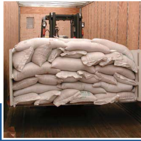
袋装种子搬运器 Bagged Seed Handler

Train Wheel Drive Handler 高效的设计，可用于搬运火车驱动轮组件。Efficient design for handling train wheel drive assemblies.