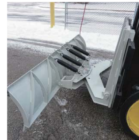
铲雪器 Snow Plow

No matter what industry or application, Cascade is always working on innovative solutions. If you can think it up, chances are our team of engineers can design it for you. If you don't see what you're looking for here, or you have a specific material handling challenge, call us. This is just a small sampling of our special application products.