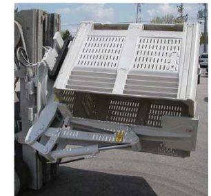
液压力旋转卸货器 Rotating Hydraulic Bin Hold Down

用于废料回收，生产几乎或任何场合。带有液压力固定装置，并带有固定式侧移叉臂，可360°旋转。 For scrap, produce or practically any application. Featuring hydraulic hold downs, fixed side forks and 360° rotation.