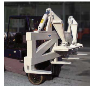
带压板的固定式加宽型搬运器 Fixed Fork Spreader with Hold Down

可通过液压系统实现货叉在垂直和水平方向的调节以适应表面不规则货物的搬运需求，如汽车车架。 Forks can be hydraulically adjusted vertically and horizontally to accommodate uneven loads such as truck frames.