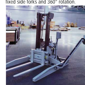
固定式带门架工作台 Stationary Mast Stand

可安全可靠地搬运较宽的货物，如管道或杆状货物。多种配置可供选择同时还可适配多种不同承载能力的叉车。 Used to secure and stabilize wide loads such as pipes or poles. Available in various configurations and to fit wide range of truck capacities.