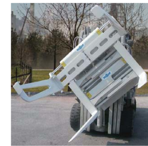
卸货器 Bin Dumper

可实现用叉车进行铲雪操作。采用弹簧机构的设计，可提供ITA标准挂钩式或叉套式两种安装方式。 Designed to utilize forklift truck for snow clearing. Spring-loaded design. Offered as ITA hook-on or slip-on fork mount.