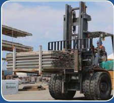
金属行业 Metal Industry