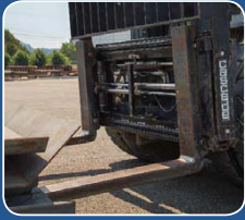
汽车行业 Automotive Industry