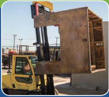
建筑行业 Construction Industry