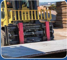
制造业 Manufacturing Industry