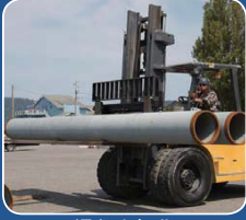
混凝土行业 Concrete Industry

专为各种恶劣环境和严苛工况而设计，L系列调距叉可应对各种严峻挑战。同时它也非常适用于需要加长型货叉或搬运大载荷中心距货物的操作。